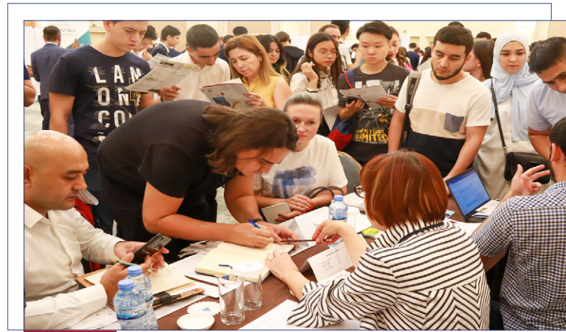
Tashkent, September 2022