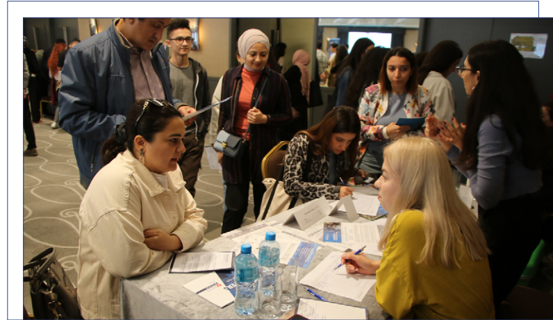
Baku, October 2022